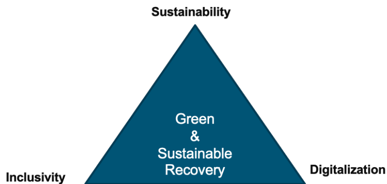
Figure 1. An Enabling Ecosystem for Sustainable Recovery

overall sustainable lending. A growing number of financial institutions globally have voluntarily adopted and implemented a broad range of sustainability practices in response to emerging challenges and stakeholders' expectations regarding social and environmental impact. This growing awareness about the materiality of sustainability issues can also be noticed among regulators and policymakers globally with the issuance of various principles on sustainable and responsible banking and investments. These include Bellagio Sustainability Assessment and Measurement Principles (BellagioSTAMP), the Principles of Value-based Banking, the Principles of Responsible Banking, Value-Based Intermediation (VBI), and the Principles for Responsible Investment (PRI), etc.